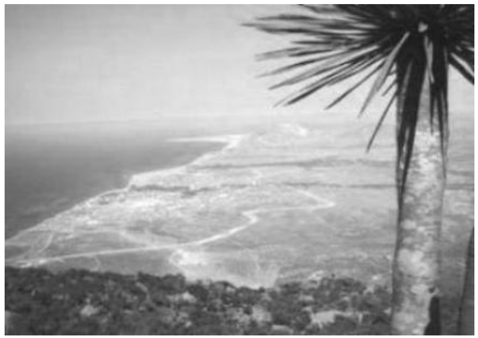
Socotra Ecotourism Society

signed<sup>4</sup>. It was he who probably became the first permanent resident Sultan of Soqotra, but he resided in Ḥawlaf (a coastal hamlet in the east of Hadiboh where a jetty, in guise of a seaport, is presently located), at least for a while. The peripatetic change of residence seemed to have been a tradition among the Sultans, as they took up temporary residence where a new bride was offered, which was a rather frequent occurrence<sup>5</sup>.