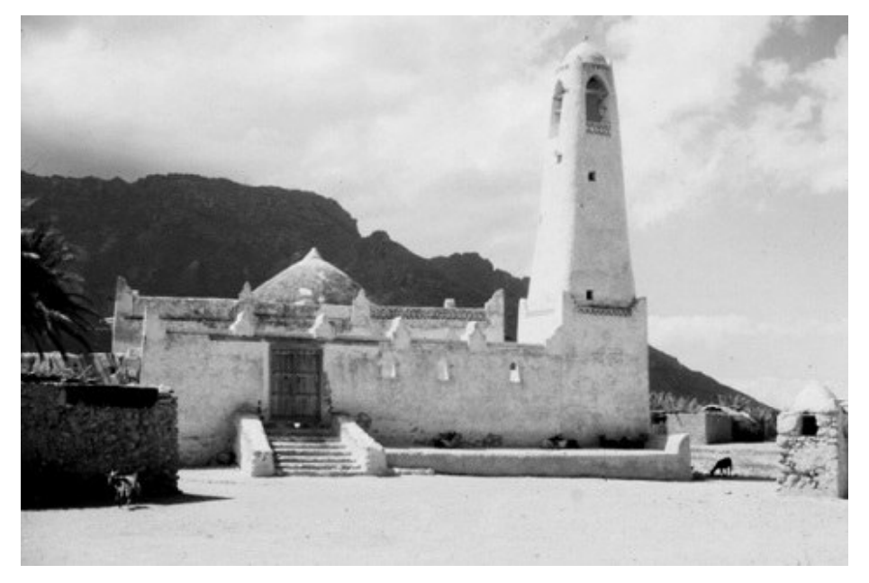
Hadiboh's oldest mosque, Al Jama'a (1964)

and his kin as well as the Arabs in exchange for food. In effect, the bedouins had a similar role to that of the akhdâm , by volunteering their services to urban groups, as herders for urban absentee owners and as surrogate mothers ( ridâ'a in Arabic, qanḥy [qanḥiyye] in Soqotri) to the children of the Sultan and Arab families. In this situation, the distinction between slaves and bedouins was rather slight, as it seemed to have been based on a combination of epidermic criteria, social stigma attached to having been purchased into service, and the absence of clan origin on the island.